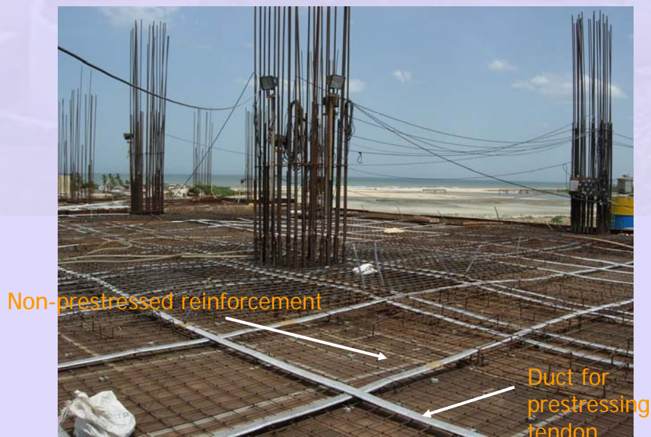
Figure 1-2.8 Biaxial prestressing of a slab

When there are prestressing tendons parallel to two axes, it is called Biaxial Prestressing. The following figure shows the biaxial prestressing of slabs.