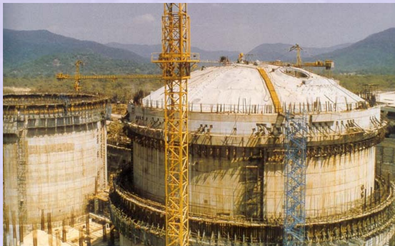
Figure 1-2.7 Circularly prestressed containment structure, Kaiga Atomic Power Station, Karnataka

When the prestressed members are curved, in the direction of prestressing, the prestressing is called circular prestressing. For example, circumferential prestressing of tanks, silos, pipes and similar structures. The following figure shows the containment structure for a nuclear reactor which is circularly prestressed.