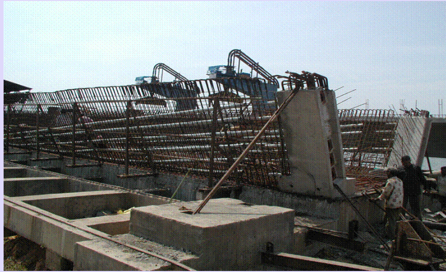
Figure 1-2.3 Internal prestressing of a box girder