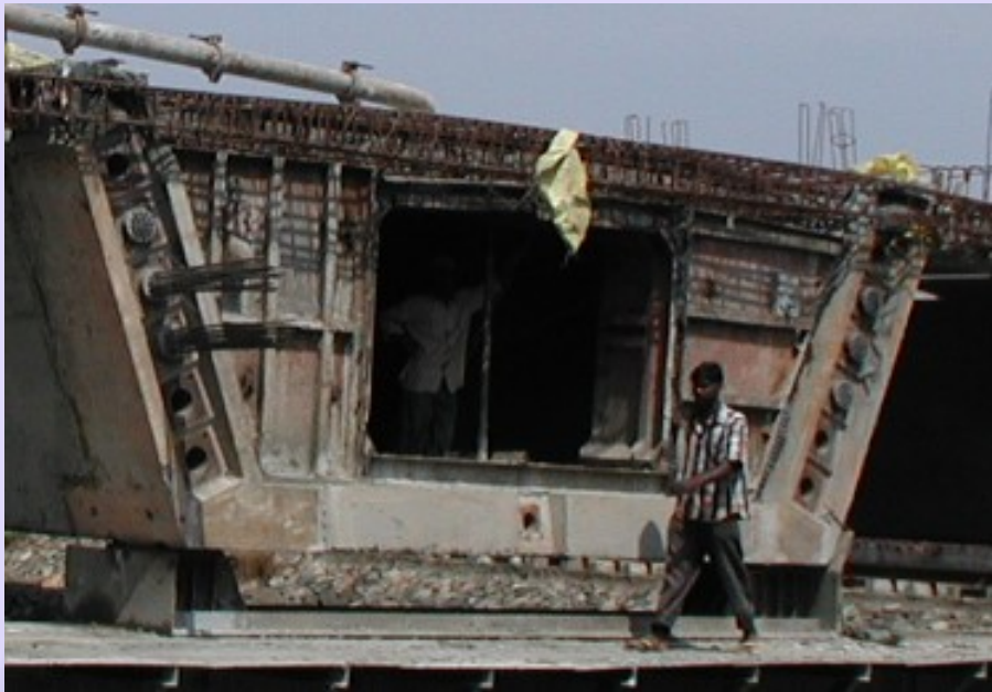
Figure 1-2.5 Post-tensioning of a box girder

The tension is applied to the tendons (located in a duct) after hardening of the concrete. The pre-compression is transmitted from steel to concrete by the anchorage device (at the end blocks). The following figure shows a post-tensioned box girder of a bridge.