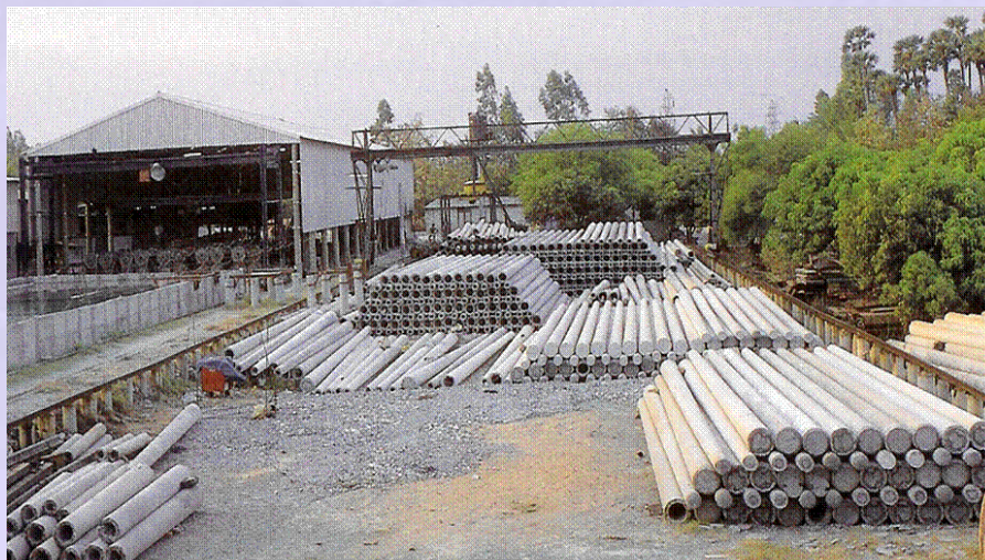
Figure 1-2.4 Pre-tensioned electric poles

The tension is applied to the tendons before casting of the concrete. The pre-compression is transmitted from steel to concrete through bond over the transmission length near the ends. The following figure shows manufactured pre-tensioned electric poles.