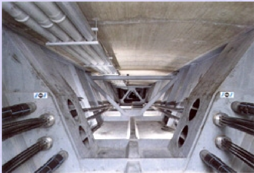
Figure 1-2.2 External prestressing of a box girder (Reference: VSL International Ltd.)

When the prestressing is achieved by elements located outside the concrete, it is called external prestressing. The tendons can lie outside the member (for example in I-girders or walls) or inside the hollow space of a box girder. This technique is adopted in bridges and strengthening of buildings. In the following figure, the box girder of a bridge is prestressed with tendons that lie outside the concrete.